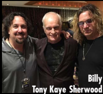
Billy Tony Kaye Sherwood